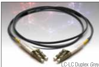
LC-LC Duplex Grey