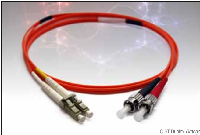
LC-ST Duplex Orange