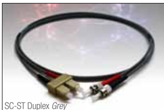
SC-ST Duplex Grey