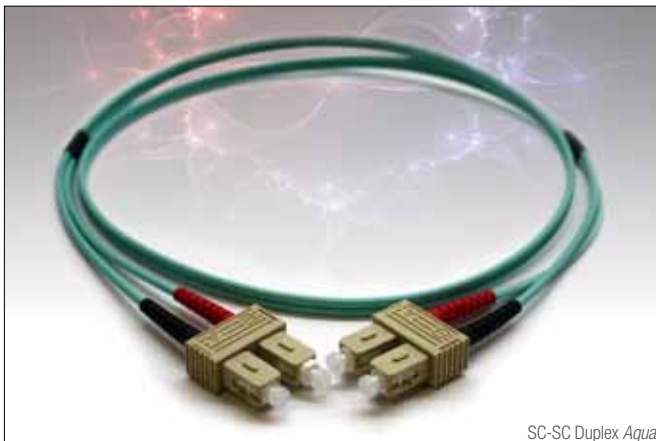
SC-SC Duplex Aqua

Multimode optical fibre is suitable for communication over short distances; such as in an office building or school. Multimode fibre equipment is cheaper than singlemode, and due to its high capacity and reliability, multimode fibre is ideal for backbone applications.