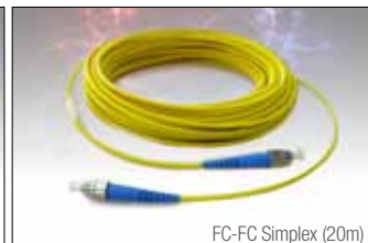
FC-FC Simplex (20m)